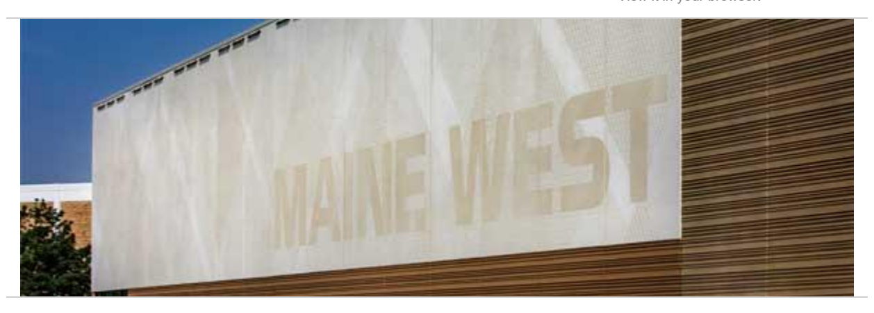
Why do I love precast? Let me count the ways.