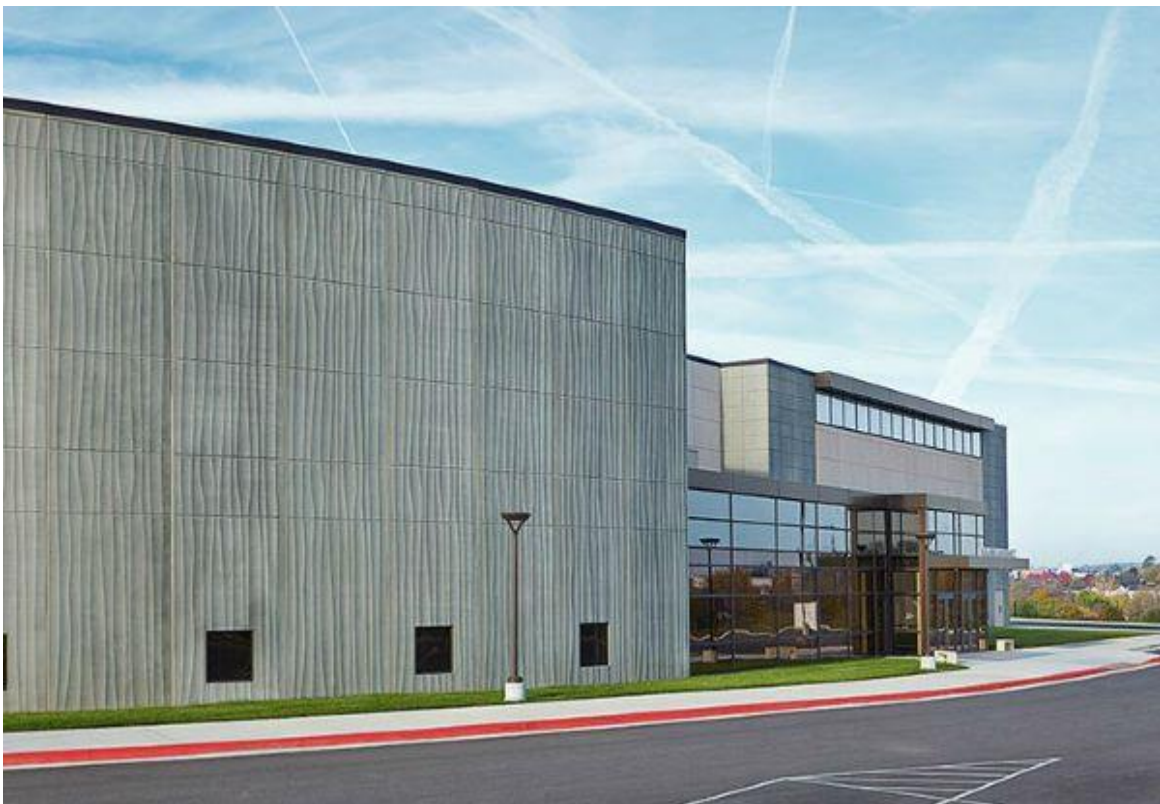
(Hempstead High School: Dubuque, IA)

When it comes to finishes for precast concrete wall panels , the possibilities are (nearly) endless.